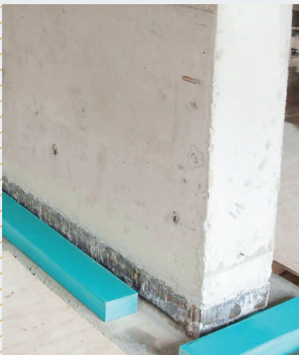
Detail of the pointwise support of the Mezzanine floor. Bearing dimension customized according to given performance criterias as well as specific loading.

Getzner Werkstoffe is more than just a developer and manufacturer of materials for vibration mitigation and isolation. The company is also an experienced consultant in construction engineering issues related to vibration and isolation. Getzner's experts are deeply involved in system development and realization of projects right from the very beginning. Cooperation begins with definition of the overall design conditions and often ends with the development of new, ground-breaking solutions. Thanks to Getzner's technical expertise in the field of vibration isolation, the end result is a smart system using elastic materials, which ensure a high levels of costeffectiveness, noise protection and comfort.